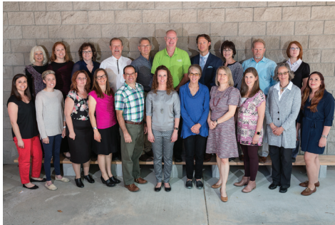
Our Medical Team