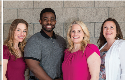
Our Pharmacy Team