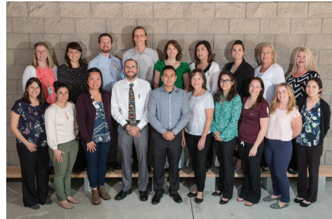
Our Dental Team